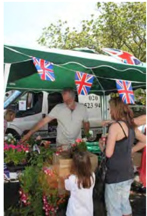
The ever popular garden workshop

Delicious refreshments were provided for all that attended. Many thanks to London Borough of Waltham Forest and several of the contractors that work for Friday Hill TMO who kindly sponsored this event.